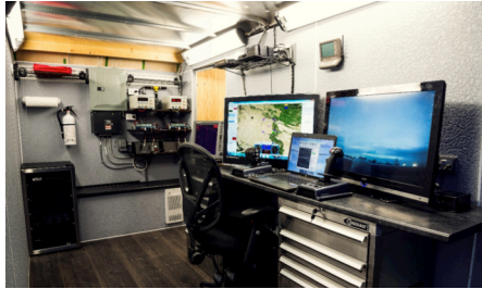
E100 Ground Control Station (GCS)

Our Professional services can provide data supporting: