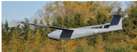
E100 with the CAE MAD-XR installed in wing pods

Experienced in rapid response deployment we can provide client tailored UAV flight operations.